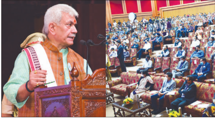
Governor also e-inaugurated and laid e-foundations for various Water Supply & water conservation activities. In order to augment water supply across the UT, the Lt

Jammu, Mar 22 : With an aim of taking water conservation to grass-roots level through people's participation across the country, Prime Minister, Narendra Modi today launched "Jal Shakti Abhiyan: Catch the Rain" Campaign on the occasion of "World Water Day". Lieutenant Governor, Manoj Sinha presided over the UT level event held at Convention Centre, Jammu to mark the occasion. He called for active participation of elected representatives and people of J&K in rainwater harvesting