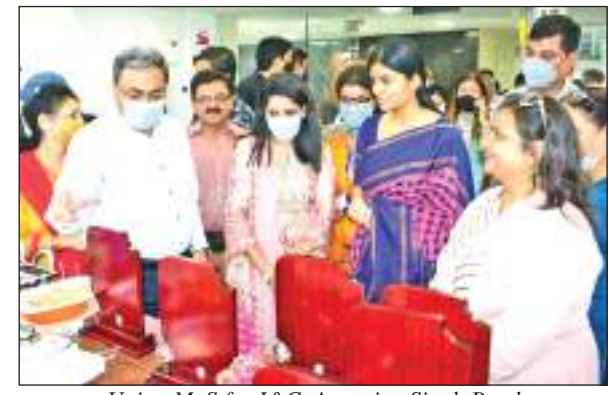
Union MoS for I&C, Anupriya Singh Patel visiting a stall at Jammu Haat.

■ STATE TIMES NEWS JAMMU: A 30 days Exhibition cum Sale under the public outreach programme was inaugurated by Union Minister of State for Industries and Commerce, Anupriya Singh Patel at Jammu Haat to celebrate 'Azadi Ka Amrit Mahostav here on Tuesday.