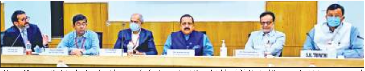
Union Minister Dr Jitendra Singh addressing the first-ever Joint Round-table of 23 Central Training Institutions organized for Capacity Building, at Indian Institute of Public Administration (IIPA) New Delhi, on Tuesday.

■ STATE TIMES NEWS NEW DELHI: Union Minister of State (Independent Charge) Science & Technology; Minister of State (Independent Charge) Earth Sciences; MoS PMO, Personnel, Public Grievances, Pensions, Atomic Energy and Space, Dr Jitendra Singh on Tuesday emphasised integrated Capacity Building through integrated training for officers. The era of working in silos is over, he said.