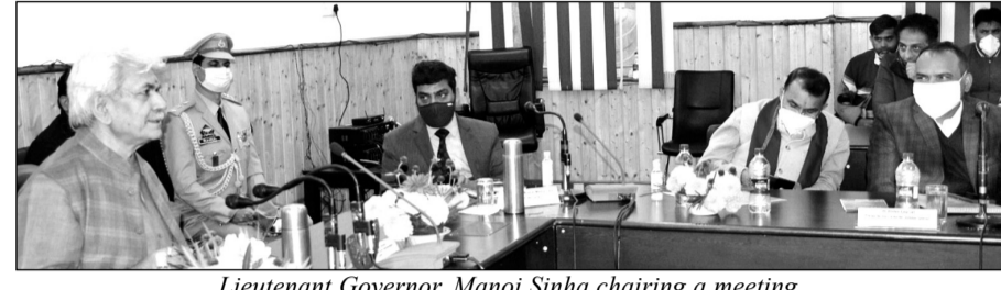
Lieutenant Governor, Manoj Sinha chairing a meeting.

strive for saturation of all Central and UT level social security and welfare schemes, adding that these schemes are launched with the purpose to improve socio-economic condition of the people. Observing that the infrastructure projects are being completed at a remarkably brisk pace, the Lt Governor instructed officials for furthering pro-active and people-centric governance to bring about a qualitative improvement in the quality of life, and ease of living of people. "Timely implementation is the key to sustainable development. No delay will be acceptable", he added. Two senior officials of the Jal Shakti Department, Superintending Engineer, and Technical officer were attached for unwarranted delay in implementation of various projects. On the occasion, the Lt