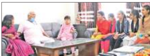
RSS Chief Dr Mohan Bhagwat interacting with girls of Sewa Bharti hostel.