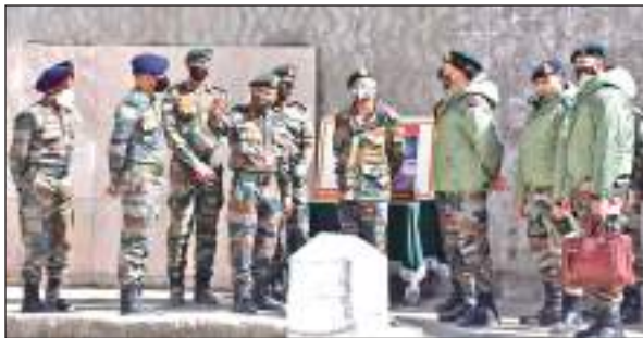
CoAS, Gen MM Naravane during visit to RezangLa War Memorial in Eastern Ladakh on Friday.

He was given a detailed briefing about the overall situation in the region at the headquarters of the 14 Corps, popularly known as the 'Fire and Fury Corps', that takes care of guarding