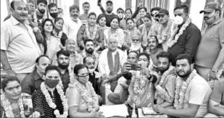
NC President Dr Farooq Abdullah welcoming new entrants in party fold.

The visiting delegation members brought up the issue of enhancement of monthly relief assistance from Rs.13000 to Rs 25000, safety and security of PM package employees working in the Valley