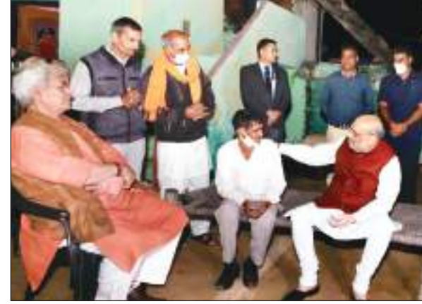
Home Minister Amit Shah at Chowkidar Chuni Lal's house in Makwal village.

Minister to Chuni Lal's house at Makwal village in Jammu district on Indo-Pak border carried a message