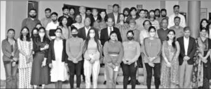
Students, faculty members and others during a workshop.