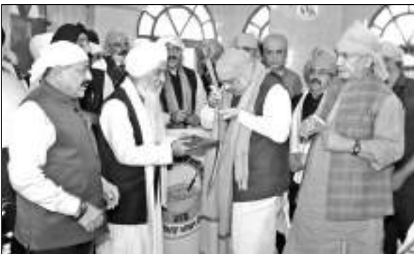
Union Home Minister, Amit Shah during visit to Gurdwara at Digiana, Jammu.

"It's the land of temples of Mata Vaishno Devi, of Prem Nath Dogra, the land of sacrifice of Syama Prasad Mukherjee. We won't let disruption the peace in Jammu and Kashmir," he said.