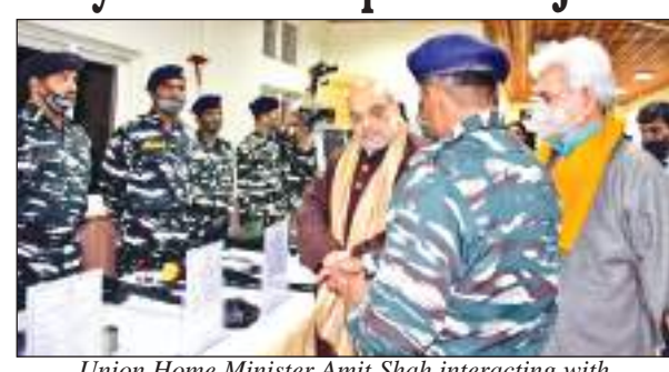
Union Home Minister Amit Shah interacting with Army Jawans at Lethpora Pulwama.