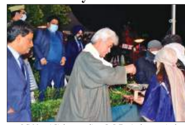
LG Manoj Sinha attending Sufi Festival, a mystical musical evening at Botanical Garden, Srinagar.