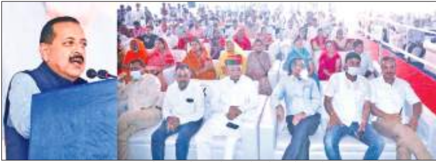
Union Minister Dr Jitendra Singh speaking after launching the state-of-the-art Helicopter-borne or Heli-borne Survey technology for Groundwater management at Jodhpur, Rajasthan on Tuesday.

Speaking on the occasion, Dr Jitendra Singh said that the water technologies of CSIR from source finding to water treatment will benefit millions of people across the