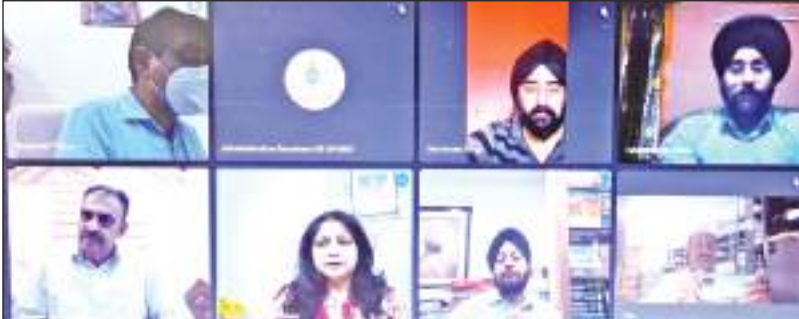
J&K book suppliers interacting during a webinar.