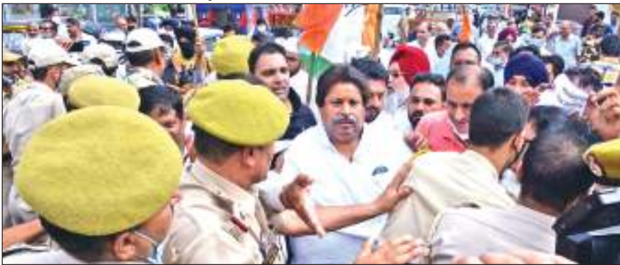
Congress leaders scuffling with police during a protest.