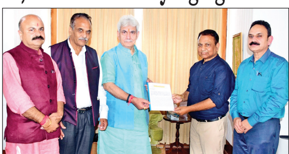
Various communities delegation members presenting memorandum to LG, Manoj Sinha.

They said that when Constitution of India debars discrimination on the ground of religion, race, caste, sex etc how can the bureaucracy deprive any person from doing agriculture business on the ground of his caste? He expressed concern on the fact that the Registration