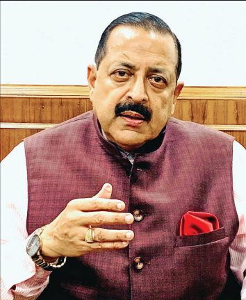
Union Minister Dr Jitendra Singh briefing the media about exclusive technology initiatives for Scheduled Castes and Scheduled Tribes , at New Delhi on Wednesday.

Dr Jitendra Singh said, the decision has been taken in tune with Prime Minister Narendra Modi's vision and resolve to handhold the weaker sections and raise them at par with other sections of society, so that all could collectively contribute to take India to new heights in the next 25 years.