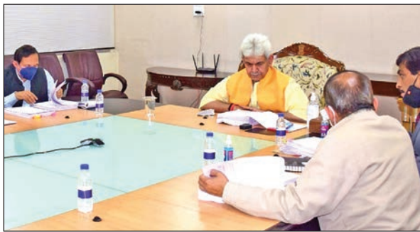
LG Manoj Sinha chairing Administrative Council meeting at Srinagar.

Establishment of new terminal will significantly