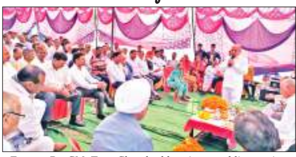
Former Dy CM, Tara Chand addressing a public meeting.

■ STATE TIMES NEWS JAMMU: The members of recently formed Central Zone Committee of Democratic Azad Party (DAP) led by former Deputy Chief Minister Tara Chand on Sunday met with delegations of Chhamb and Akhnoor assembly constituencies at border village Pallanwalla to propose the names for Distt. Jammu and Central Zone Committees. Members led by former Deputy Chief Minister Tara Chand, former MLA Bahwan Singh, Senior leader and Advocate MK Bhardwaj, Corporators Gourav Chopra, Sobit Ali and Vicky Mahajan interacted with delegates of both the assembly constituencies. Visited delegates unanimously proposed the names for Distt. Jammu and Central