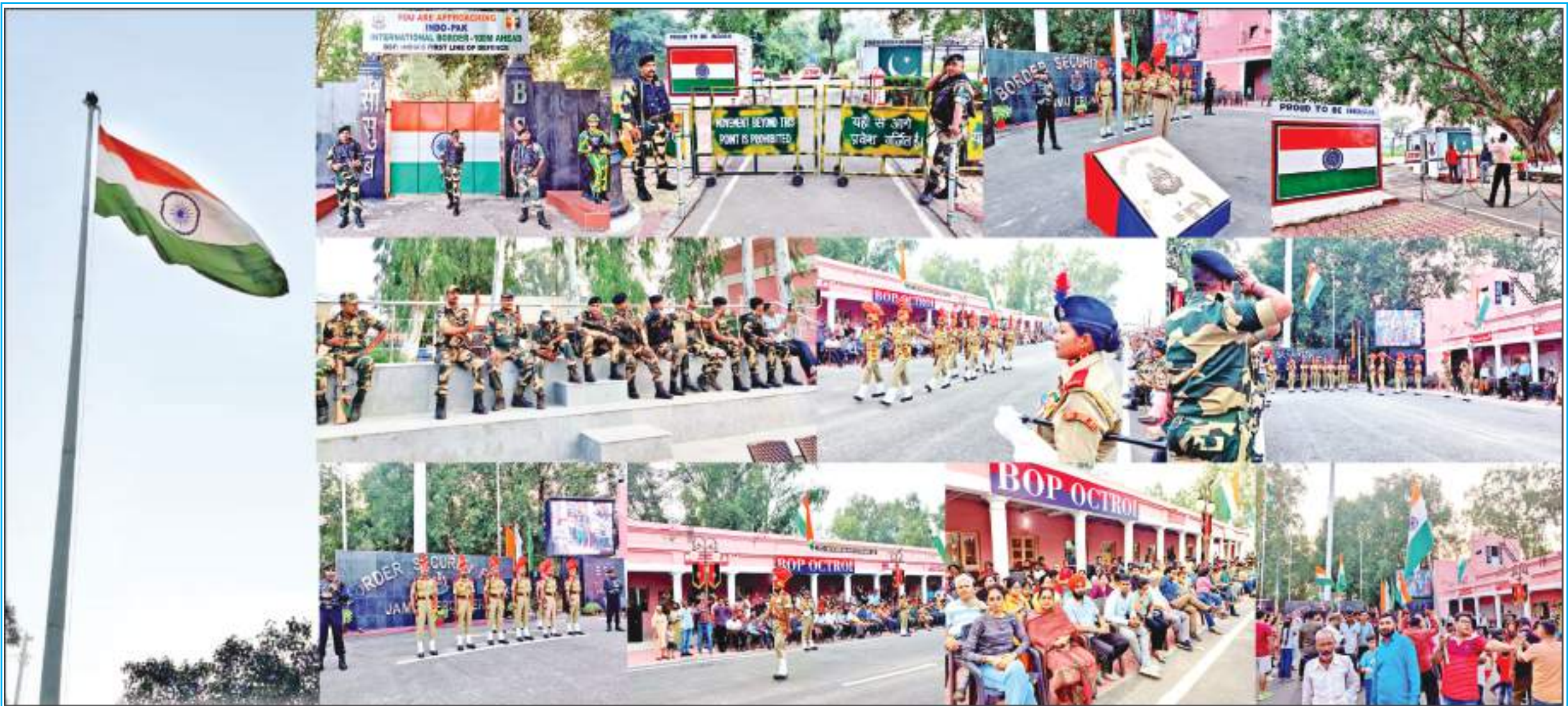
Glimpses of Beating the Retreat ceremony conducted by Border Security Force (BSF) personnel at Octroi post on India-Pakistan border in Suchetgarh.

Zone Committees of and Kashmir. He urged the delegates to join hands for the propagation of the policies and programmes of Azad among the common and needy persons of the State. He said that DAP will vigorously fight to ensure justice to common people. He reiterated party's commitment to restore statehood, legal job and land opportunity for people of Jammu and Kashmir.