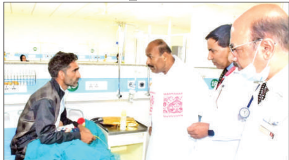
Union Minister for Social Justice and Empowerment, Dr Virendra Kumar interacting with a patient during visit to hospital in Srinagar.

The Minister also took stock of the special school for differently abled children. He