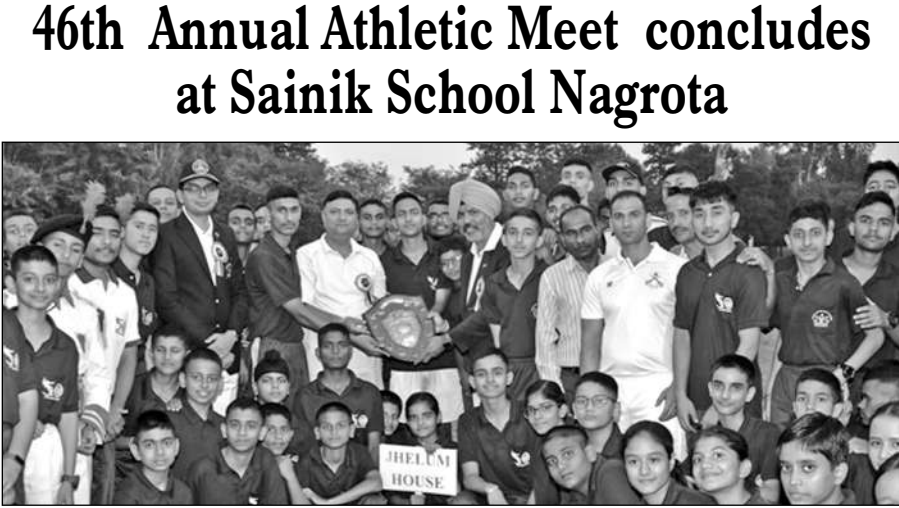
Chief Guest presenting trophy to a winner team at Nagrota.