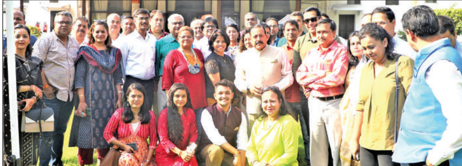
Union Minister Dr Jitendra Singh flanked by journalists from electronic and print media during the Luncheon meeting hosted by him at his residence at New Delhi on Saturday.

Many of the journalists present were very appreciative of the 'Purple Revolution' and 'Aroma Mission' originating from Jammu & Kashmir and wanted to do stories on lavender cultivation. They