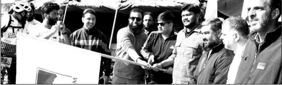
DC Ganderbal, Shyambir flagging of cycle race from Stadium.