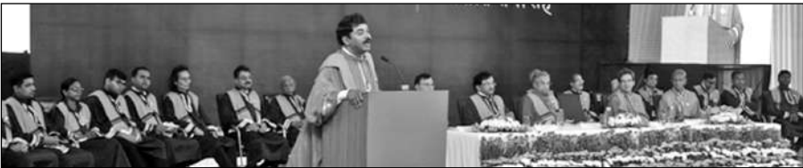
A dignitary speaking at 3rd Convocation ceremony of IIT Jammu at the Jagti campus.