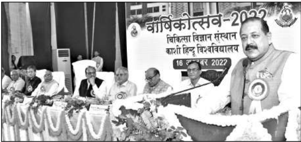
Union Minister Dr Jitendra Singh speaking, as chief guest, at the Institute of Medical Sciences, Banaras Hindu University (BHU) on Sunday.

Presiding over the Annual Day celebrations as chief guest at BHU , Dr Jitendra Singh said, the Institute of Medical Sciences (IMS) in BHU is a unique medical centre in the University in the sense that it has faculty of Ayurveda as well as indigenous medical systems, Dental Science along with Allopathy and other modern or western systems medicine. It is also planning to intro-