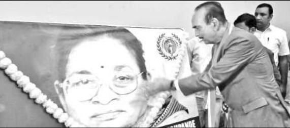
President GGF, Ghulam Nabi Azad, paying floral tributes to Gandhian Padma Vibhushan Dr. Nirmala Deshpande.

Padma Bhushan Ghulam Nabi Azad, President Gandhi Global Family and former Chief Minister Jammu & Kashmir, while paying floral tributes to eminent Gandhian