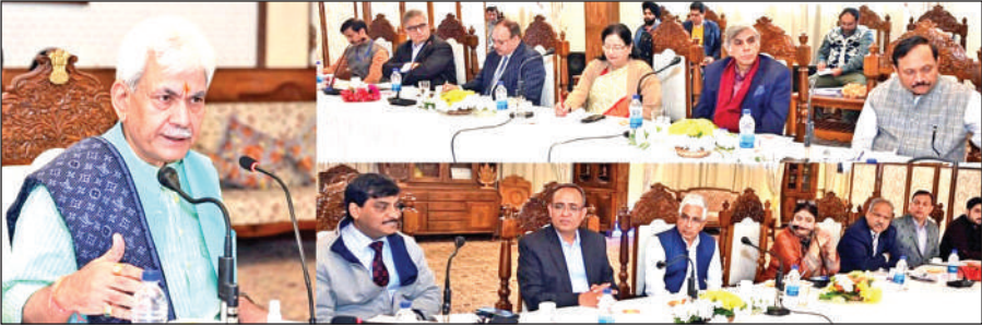
Lt Governor Manoj Sinha chairing a meeting of J&K Higher Education Council at Srinagar.