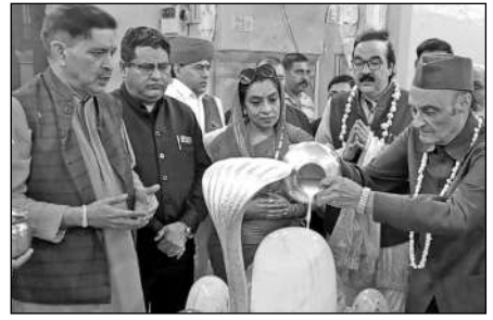
Dr Karan Singh, Chairman Trustee of JKDT performing Puja of Shiv Lingam.