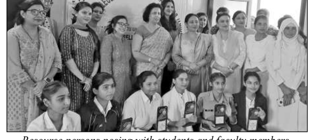
Resource persons posing with students and faculty members.