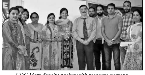
GDC Marh faculty posing with resource persons.