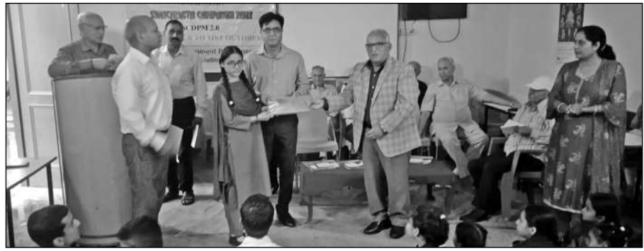
Dignitaries presenting prize to a student.