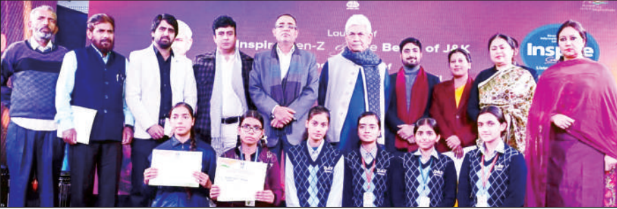
Lieutenant Governor Manoj Sinha posing for a photograph with Government officials and artists during launch of a digital show.

From communicating Government programmes and policies to the public to disseminating cultural tradition, the Information Department is playing an important role by