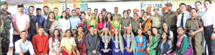
NCC cadets and other dignitaries at EBSB camp in Nagrota.