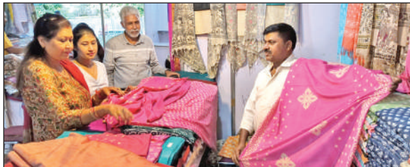
Customers visiting stall at Silk Expo in Jammu.

It was informed in a press statement issued by National Weavers Association, registered with the Ministry of Textile, which organizes Silk Weavers Expo every year in different states of the country where authentic and pure Silk & Handloom products are made available. For the very