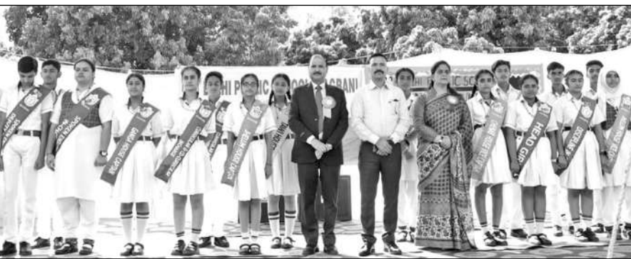
Faculty along with students during the event.