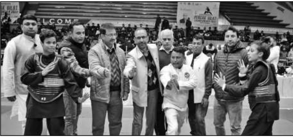
Dignitaries along with organisers during the event.