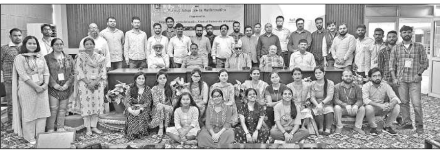
Dignitaries and resource persons along with students during the programme.