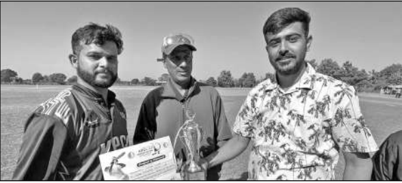
Man of the Match award being presented to a player at Country Cricket Stadium Gharota in Jammu.