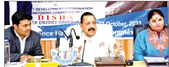
Union Minister Dr Jitendra Singh presiding over DISHA meeting at Kishthwar on Sunday.

progress of the district kishthwar, Dr Jatindra singh stressed the administration to give a major flip to the tourism sector in the District. He stressed to lay focus on the potential areas of tourism like the religious tourism, trekking and mountaineering, adventure tourism and upgradation of camping sites in the district to attract the larger tourist footfall in District.