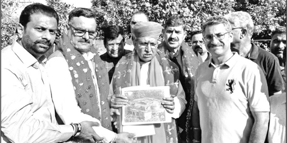
Councillor Sanjay Baru presenting memorandum to Union Minister Arjun Ram Meghwal at Jammu.