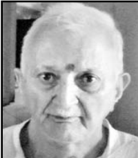
SHRI DURGA PRASHAD DHAR