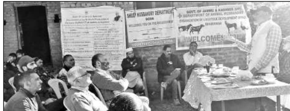
ADH official educating farmers.