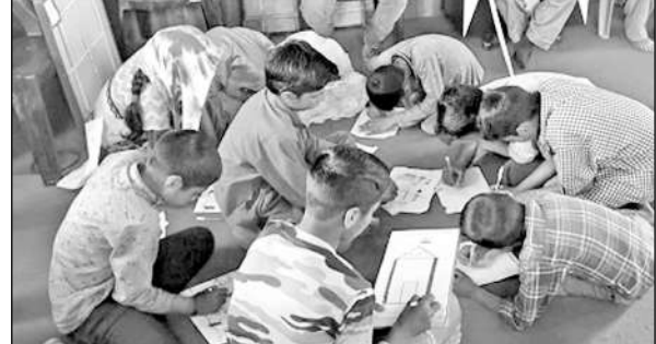
Children participating in painting competition.

■ STATE TIMES NEWS DODA: Jammu and Kashmir Academy of Art, Culture and Languages, Sub office Doda, with the active support of School Education Department, has been organising Talent Hunt Programmes in Singing and Visual Arts/ Painting in all Panchayats of the District under the Jan Abhiyan. In this connection, a Programme was held today at Government Higher Secondary School Kastigarh. The contestants from seven Panchayats namely Lower Munddhar A, Dhandal A, Kuddhar A, Kastigarh A, Bhagwah lower A, Gagla and Upper Munddhar participated in the event. The participants were judged as First, Second and Third in each field. A similar programme was also held at Panchayat Dhadkaie of Tehsil Gandoh for the local youth. The participants, who stood first, second and third in these competitions shall compete on Zonal Level.