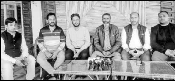
Pahari ethnic people briefing media at Poonch.

■ STATE TIMES NEWS POONCH: In a simple but significant manner the Pahari ethnic people in one voice hailed the recent amendment in the J&K Reservation Rules, 2005 by virtue of which the word "Pahari Speaking People" shall be substituted as "Pahari Ethnic People".