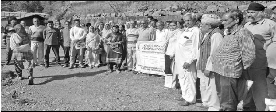
KVK officials along with farmers during the programme.

■ STATE TIMES NEWS POONCH: In line with series of activities conducted under NICRA Project, Krishi Vigyan Kendra, Poonch organized a seed distribution ceremony under 'Back to Village' programme. The programme was held under the auspices of Directorate of Extension, S h e r - e - K a s h m i r University of Agricultural Sciences and Technology of Jammu (SKUAST-J) today conducted an awareness cum distribution programme at village Mangnar in which a large numbers of farmers