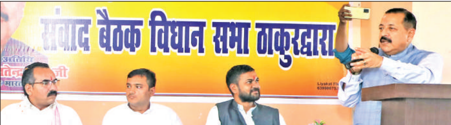
Union Minister Dr Jitendra Singh addressing College students at Krishna Mahavidyalaya, Thakurdwar, Moradabad on Thursday.

■ STATE TIMES NEWS MORADABAD: Union Minister, Dr Jitendra Singh on Thursday said, National Education Policy (NEP-2020) seeks delinking degree from education and livelihood opportunities.