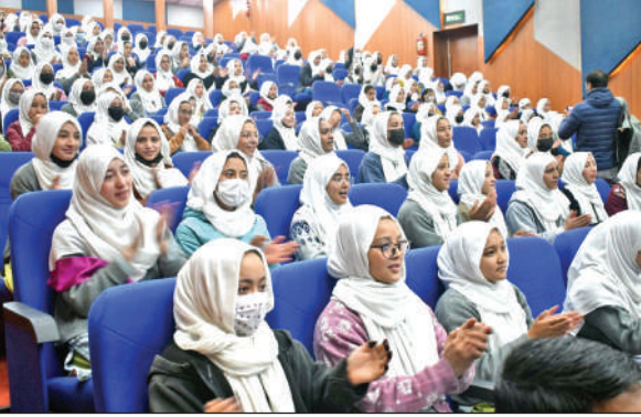
Students and others during a public outreach programme at Syed Mehdi Memorial Auditorium in Kargil.

age, information is a very powerful tool for empowering masses and there is a need to reach out to the people living in the rural areas.