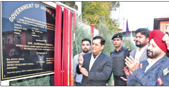
Union Minister of AYUSH, Sarbananda Sonowal inaugurating road project from Khurhama to Chewa.

■ STATE TIMES NEWS GANDERBAL: Union Minister of AYUSH, Ports, Shipping and Waterways, Sarbananda Sonowal on Thursday visited District Ganderbal under Union Government's Public Outreach programme. The Minister distributed financial assistance under various schemes amounting to Rs 12.35 lakh among the beneficiaries. He also handed over sanction letter under PMEGP, hearing aids, prosthetics and orthotics, wheel chairs, land passbooks, income certificates, Golden Cards, sports kits and sanction letters