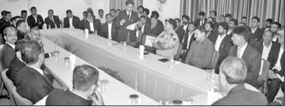
Delegation highlighting demands.