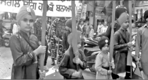
Children participating in Nagar Kirtan.

■ STATE TIMES NEWS UDHAMPUR: Sikh Sangat of Udhampur took out an impressive Nagar Kirtan in Udhampur city in view of upcoming 554th Parkash Utsav of Shri Guru Nanak Dev. Large number of Sikh Sangat including women and youth took out an impressive Nagar Kirtan in Udhampur which