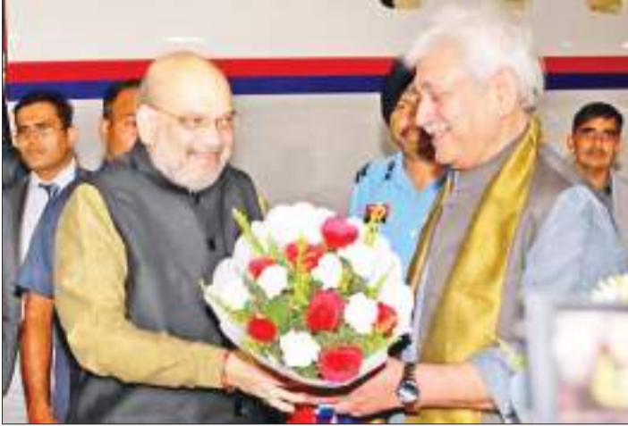
LG Manoj Sinha welcoming Home Minister Amit Shah on his arrival in Jammu while a delegation of Pahari Community meeting Amit Shah. (More pics on pg-3)