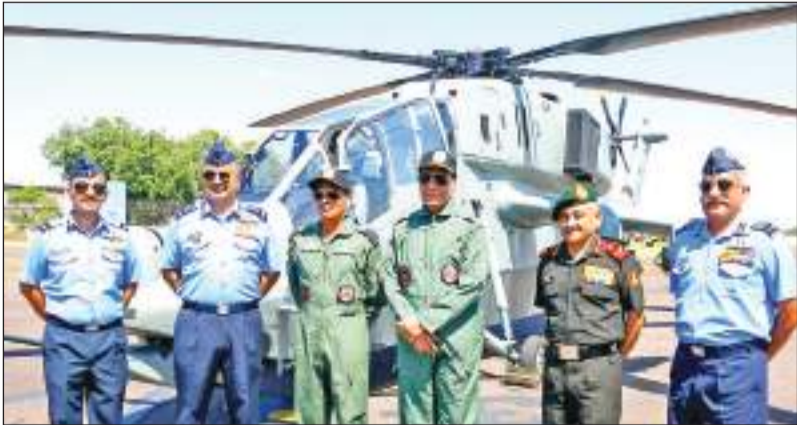
Defence Minister Rajnath Singh along with others after taking a sortie on newly inducted indigenously developed Light Combat Helicopter to Indian Air Force in Jodhpur.

■ STATE TIMES NEWS JODHPUR: The Indian Air Force (IAF) on Monday inducted the first fleet of indigenously-built Light Combat Helicopter (LCH), which has been developed primarily for mountain warfare after a requirement for it was felt during the Kargil war in 1999.