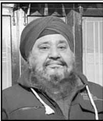
S. Manmohan Singh