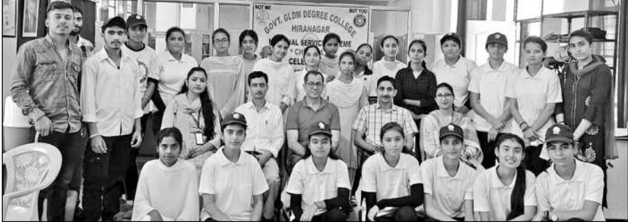
Faculty along with students during the event.