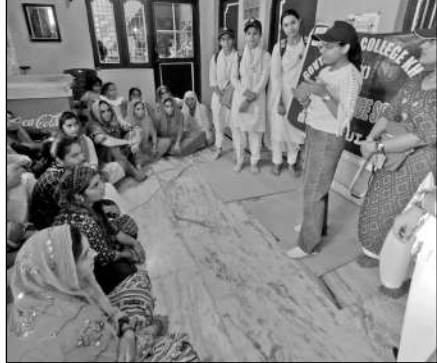
NSS volunteer imparting awareness.