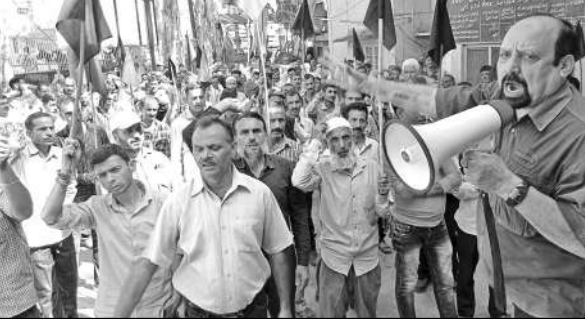
PHE employees staging protest at Udhampur.