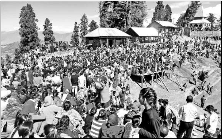
People thronging to Asht-Bhuj goddess temple to pay obeisance.

The place is surrounded by lush greenery and rich biodiversity. The