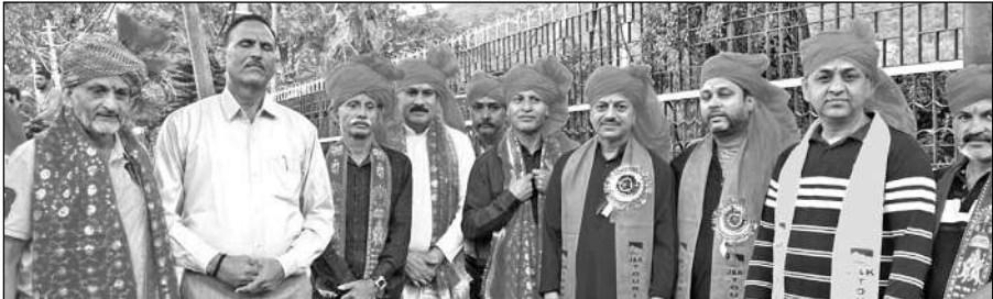
Dignitaries during the Prabhat Pheri at Katra.