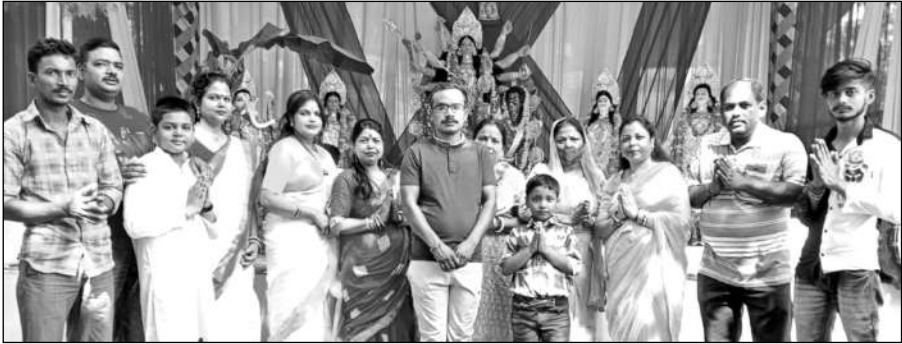
Members of Bengali community during Durga Puja celebration.

The ladies arranged the Puja Upachar and male members whole heartedly joined on hands for other preparations.