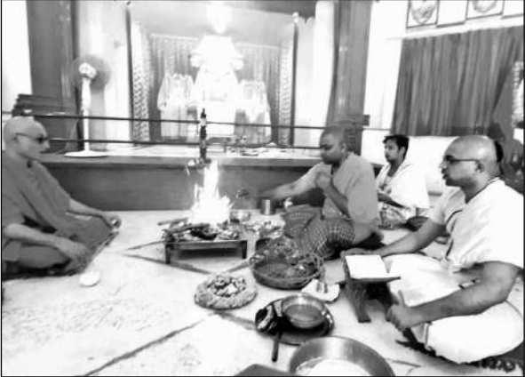
A Hawan being performed at Ramakrishana Mission Ashram in Jammu.