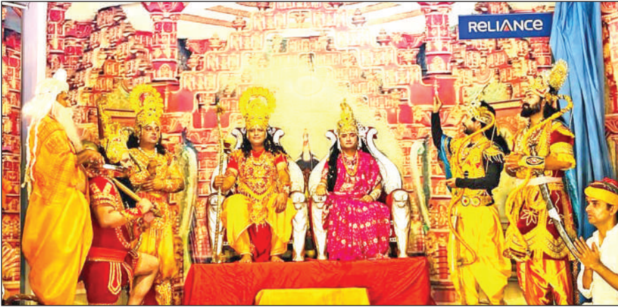
Ramlila concluding at Shree Ram Leela Club, Sainik Colony with presentation of scene depicting coronation of Bhagwan Shri Ram.

The Ramlila is the story of God Rama from his birth. It recites his childhood along with those of others who are major characters in it, such as Sita, Lakshmana, Ravana and others. It includes chapters on the marriage of Sita and Rama, the exile of Rama because Dharma requires him to give up his throne, Sita and Lakshmana joining him in the exile, their journeys through India and they meeting revered Rishis of Hinduism, the abduction of Sita by demon Ravana, the sorrow of Rama and Lakshmana, their hopelessness, how