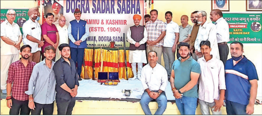
Dogr Sadar Sabha members performing Shastra Pujan at Jammu.

Another event is that the Pandavas retrieved their weapons hidden in a Shami tree after thirteen years of exile on Vijayadasami day. Guru Gobind Singh also encouraged "Shastar Puja" or worship of swords. He