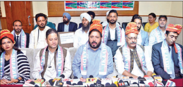
JKAADP members talking to reporters at Jammu.

Further stated that their party is a voice of people of Jammu and Kashmir and will always raise its voice whenever it required and will stand for their people.