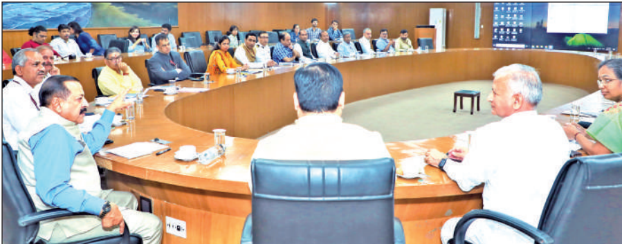
Union Minister Dr Jitendra Singh chairing a meeting to review recently concluded "Swachh Sagar, Surakshit Sagar" campaign, at Prithvi Bhawan, New Delhi on Thursday.