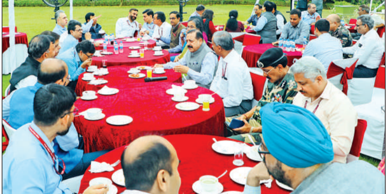
Union Minister Dr Jitendra Singh holding a luncheon interaction with IAS, IPS and IFS officers of erstwhile J&K Cadre, currently posted in Delhi, on Friday.

Dr Singh also informed the senior officers of IAS, IPS and IPoS from erst-