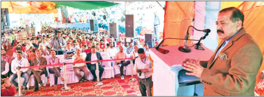
Union Minister Dr Jitendra Singh speaking after inaugurating the first-of-its-kind Science Museum developed by Union Ministry of Science & Technology at Chamba, Himachal Pradesh on Saturday.

The "DBT-NIPGR-Pandit Jaiwant Ram Upmanyu Science Museum" set up by the National Institute of Plant Genome Research, an autonomous institute of Department of Biotechnology, at Government Boys Senior Secondary School (GBSSS), Chamba will help infuse scientific temper among the