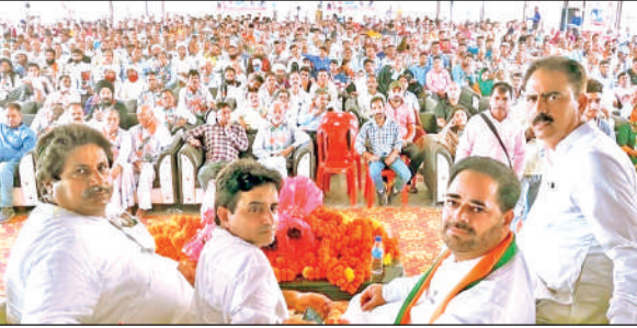
JKPCC leaders addressing a rally at Kathua.