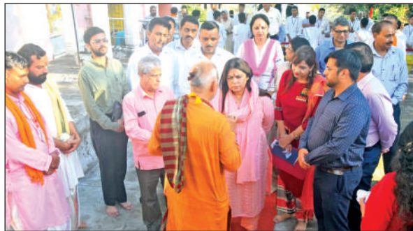
Union Minister Meenakshi Lekhi during visit to a temple at Samba on Tuesday.

Later, Union Minister inaugurated an exhibition of women Self Help Groups (SHGs) stalls in Nakshatra Gardens of Narsingh Dham. She inspected the stalls and