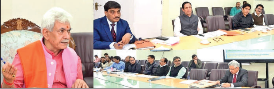
LG Manoj Sinha reviewing power scenario in Jammu & Kashmir on Tuesday.