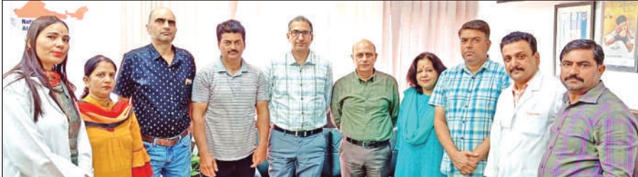
Officials of AIDS Control Society and GMC Jammu after signing MoU.