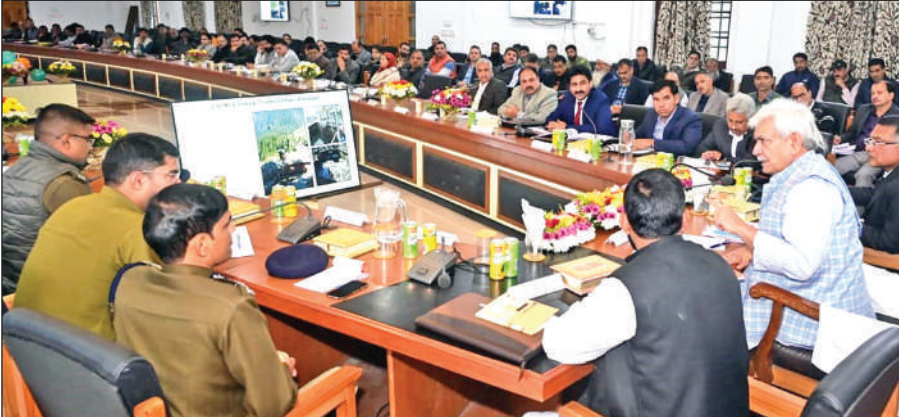
LG Manoj Sinha inaugurating and laying foundation stone of various development projects at Anantnag on Monday.