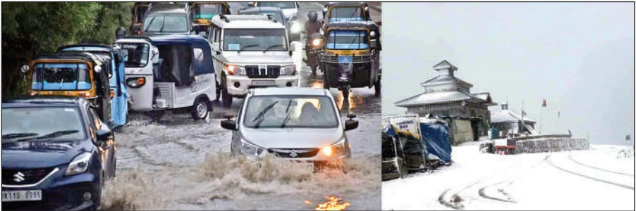
Rains lashes Jammu city on Monday while Mughal road receives fresh snowfall.

Snow, rains bring mercury down in Kashmir