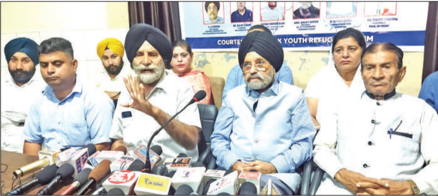
Confederation members briefing media in Jammu on Thursdays.