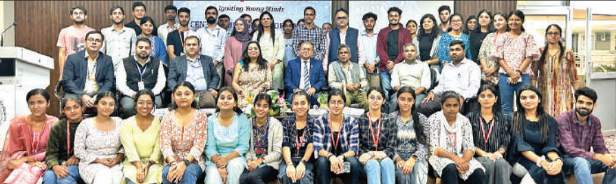
Faculty members along with students during the meet.