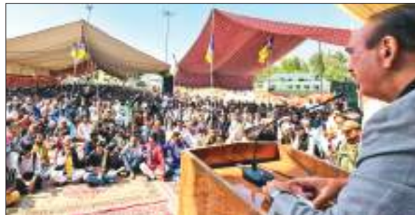
DPAP Chairman Ghulam Nabi Azad addressing gathering at Srinagar on Sunday.

"I have not come (to JK) looking for a job, I want to