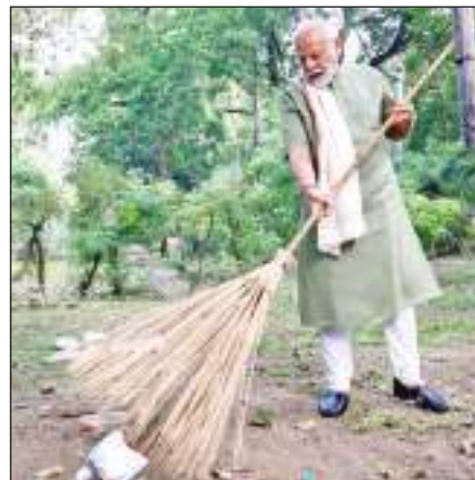
PM Narendra Modi participating in special cleanliness programme 'Ek Taarikh, Ek Ghanta, Ek Saath' in New Delhi on Sunday.