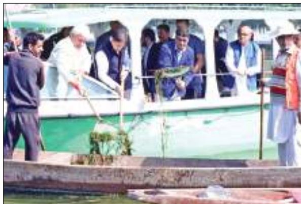
LG Manoj Sinha participating in 1-Hour of citizen-led Shramdaan for Swachhata in Srinagar on Sunday.

'Swachhata Hi Seva' Campaign, under the guidance of Prime Minister Narendra Modi has become a Jan-Andolan in the UT of