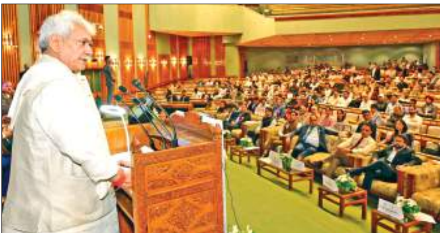
LG Manoj Sinha speaking during MoU signing ceremony between J&K State Taxes Department and ICAI at Srinagar on Sunday.

■ STATE TIMES NEWS SRINAGAR: J&K State Taxes Department on Sunday inked a Memorandum of Understanding (MoU) with Institute of Chartered Accountants of India (ICAI)