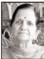
SMT VAISHNO DEVI