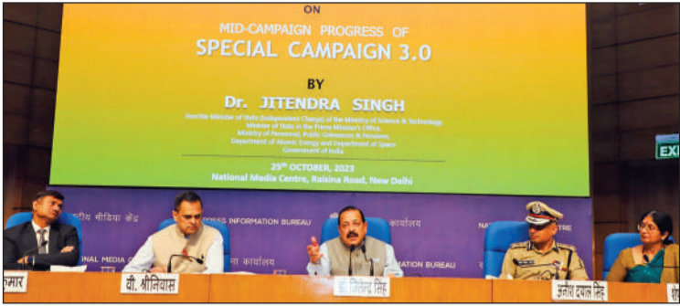
Union Minister Dr. Jitendra Singh, flanked by Union Secretaries of MoRTH, Administrative Reforms and School Education respectively and DG ITBP, addressing a press conference at National Media Centre, New Delhi.

"Now, if we can have an Artificial Intelligence driven module which can segregate the solid and liquid waste, then we have the robot which would carry this and load it on to the drone and