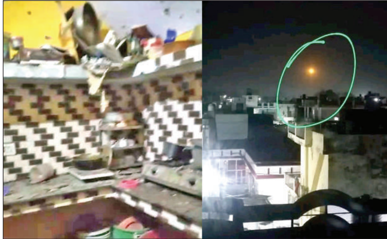
Houses damaged in heavy firing by Pakistan in Arnaria sector on Thursday night.

The firing by Pakistani troops started around 8 pm, the Border Security Force (BSF) said. "The firing is still on," the BSF said. The "unprovoked firing" is befittingly retaliated by BSF troops, it stated. Senior BSF officers were rushing to the spot, officials said.