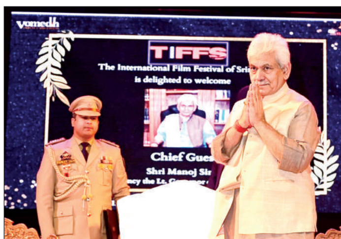
LG Manoj Sinha during 2nd International Film Festival of Srinagar on Thursday.

The Lt Governor congratulated the award winners and commended the efforts of 'Vomedh