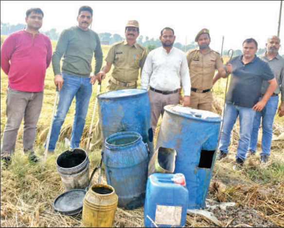
Excise sleuths along with seized material.

As a result of this operation, 3000 kilograms of "Lahan," a key ingredient in