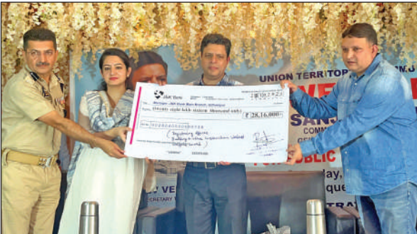
Education assistance cheque being released by the labour department.