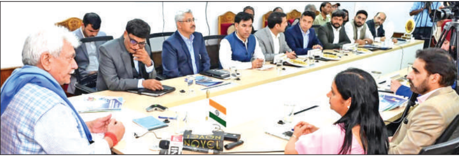
LG Manoj Sinha inaugurating 'Cashless Panchayats', adoption of BHIM-UPI mode of transactions in Gram Panchayats of J&K UT.

In his address, the Lt Governor expressed gratitude to Hon'ble Prime Minister Shri Narendra Modi Ji for shaping a new destiny of J&K, which has