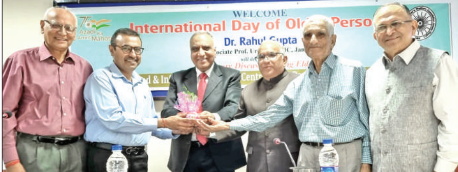
Association members along with dignitaries during the event in Jammu on Monday.