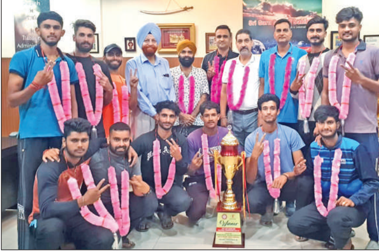
Association members along with winner team posing for photograph.