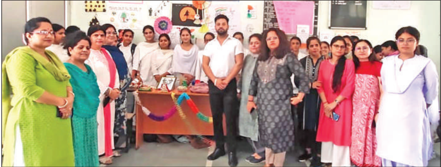
Faculty members of GDC Akhnoor along with students during the event.

The exhibition, held under the theme "Earning While Learning," was a testament to the dedication and creativ-