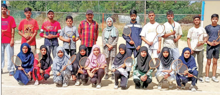
Selectors along with selected players.

SRINAGAR: J&K Ball Badminton Association conducted selection trials which were held at Gindun Sports Stadium Rajbagh, Srinagar for the upcoming 42nd Sub-Junior National Ball Badminton Championship for Boys & Girls 2023-24 to be played at Bhilai (Chattisgarh) from 15th to 19-Oct-2023. The Sports Council