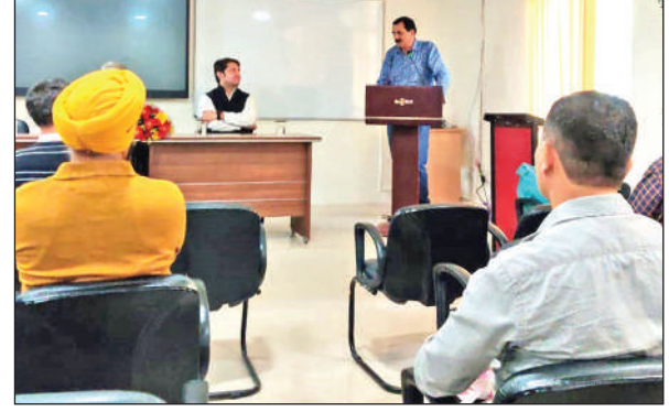
A dignitary speaking at a programme at JU.