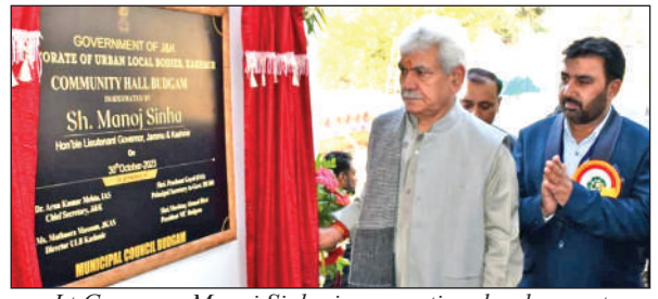
Lt Governor Manoj Sinha inaugurating development projects of Urban Local Bodies.

atory administration," the Lt Governor said. He said the realization of future development goals depends on the effective implementation of plans and policies to make cities and towns more vibrant and sustainable. Smart city and town is not just a slogan but a way of life. The well-planned infrastructure projects are being developed as a confluence of ease of living and economic progress for sustainable growth so that