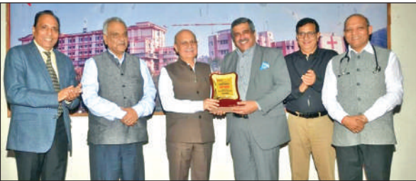
ASCOMS faculty and other doctors at a programme.